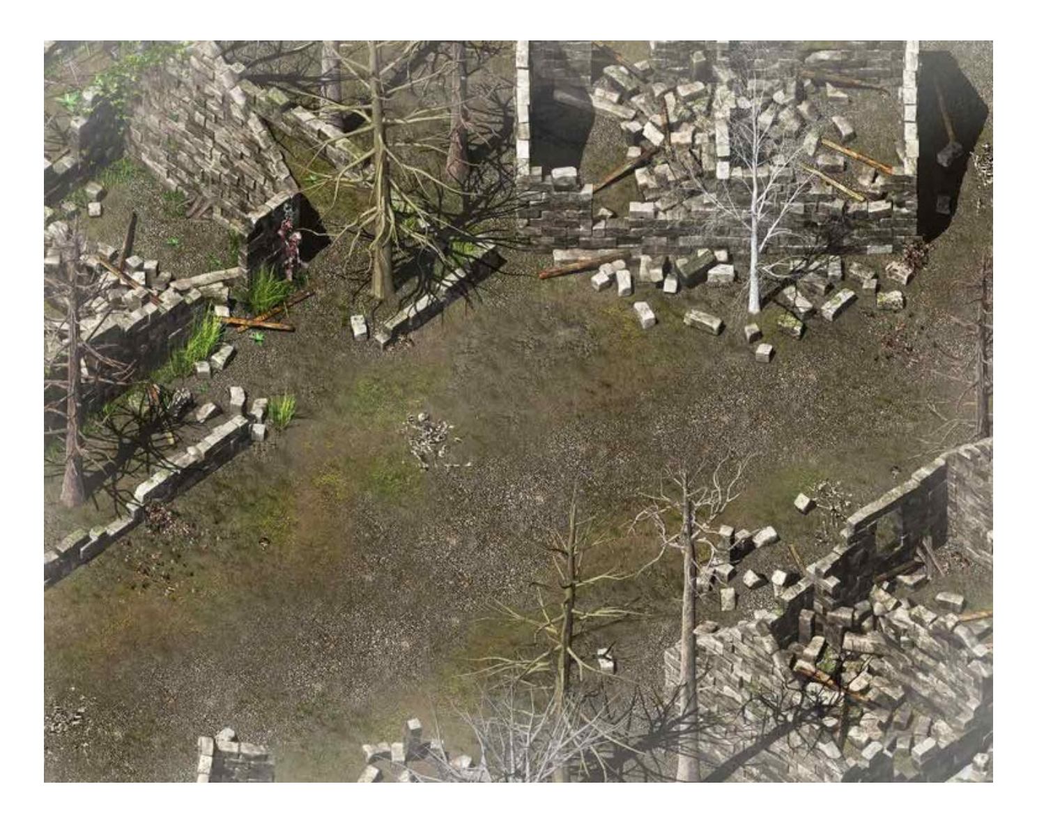
RPG Maker MV - Medieval: Expansion Activation Code [Torrent]

Download >>> <a href="http://bit.ly/2SK6x2N">http://bit.ly/2SK6x2N</a>